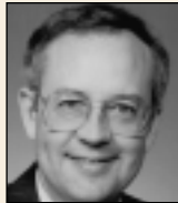
Honorable Kenneth W. Starr Former Solicitor General Kirkland & Ellis Washington, DC