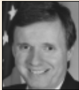
Honorable Timothy J. Muris Chairman Federal Trade Commission Washington, DC