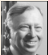
Honorable Harvey J. Goldschmid Commissioner U.S. Securities & Exchange Commission Washington, DC